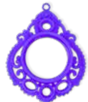
Visijet M3 CAST