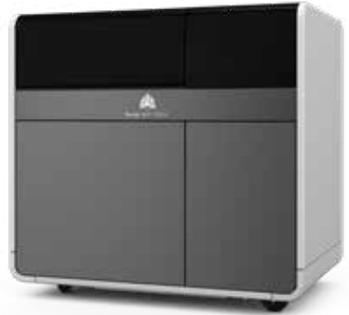
Projet MJP 2500W fast and affordable precision wax patterns 3D printer

A build area of up to 4.7 times larger than similar class printers allows for broader application coverage and extended unattended operation. Projet MJP wax printers' high productivity means fast amortization and high return on investment.