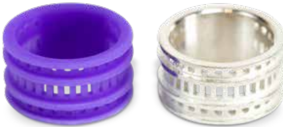
Ring printed in Visijet M2 CAST and cast in silver

Warranty/Disclaimer: The performance characteristics of these products may vary according to product application, operating conditions, material combined with, or end use. 3D Systems makes no warranties of any type, express or implied, including, but not limited to, the warranties of merchantability or fitness for a particular use.