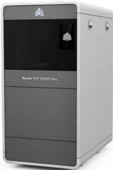
Projet MJP 3600W Series high-capacity, high throughput precision wax pattern 3D printer