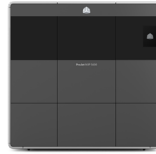
ProJet MJP 5600